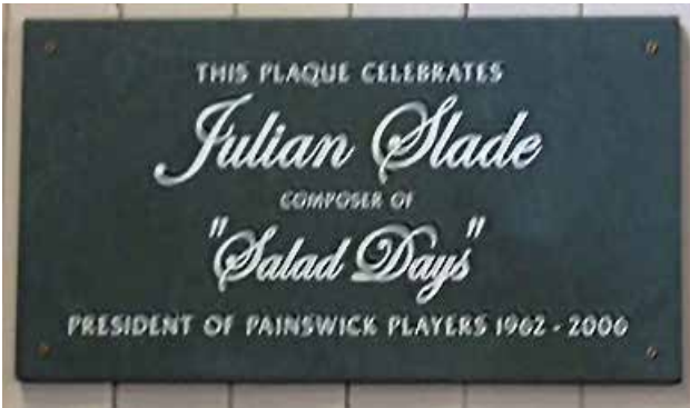
Plaque in the Painswick Centre

He and Dorothy Reynolds followed it up with 'Free as Air', which opened in 1957 and ran for over a year. Over the next few years there were numerous other collaborations and a lot of solo work, much of it very successful, but perhaps he had peaked too young. He could never quite recapture the youthful artlessness that had been part of the charm of 'Salad Days', or its phenomenal success.