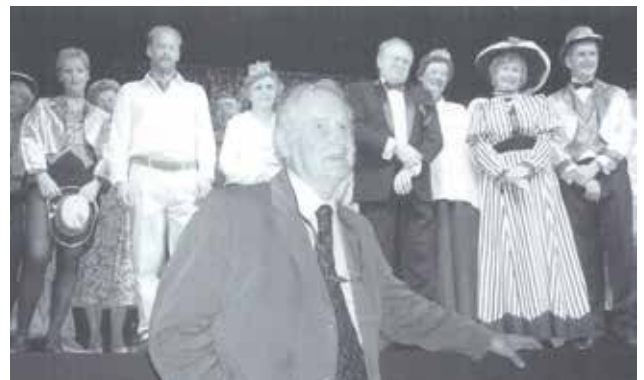
With the Cast of 'Living Legends' in Painswick in 2003