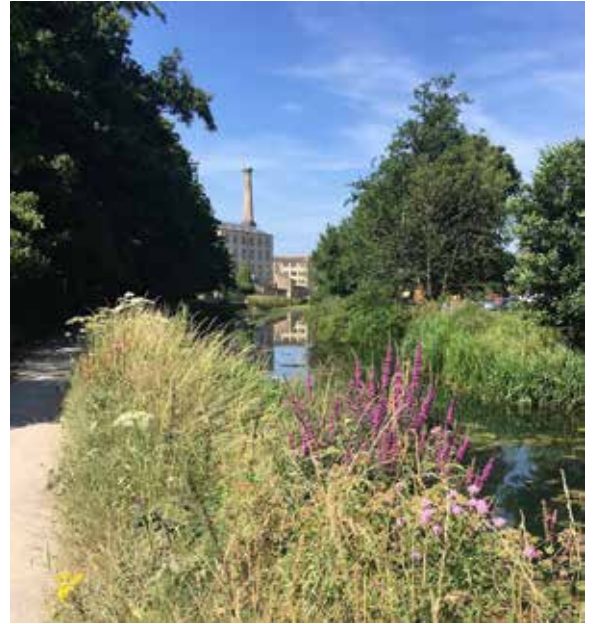
Stroudwater Navigation