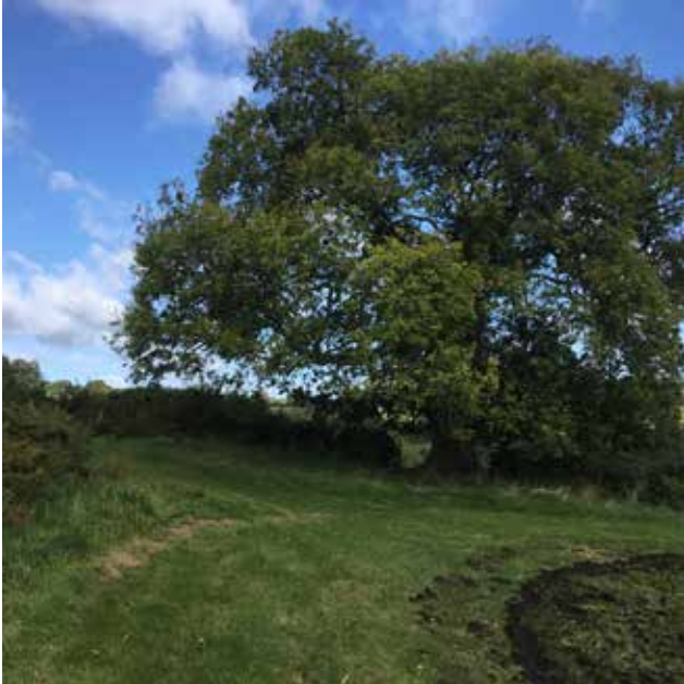
A 300 year old Ash Tree

Coppicing is cutting back trees to ground level, so new branches come up from the bases. The best time to coppice sweet chestnut, for instance, is well after the autumn leaf fall when the sap has gone down, and certainly well before the sap rises in the spring. If this is done every ten to twenty years, you can get chestnut stakes and rails of different sizes, which last quite a few years.