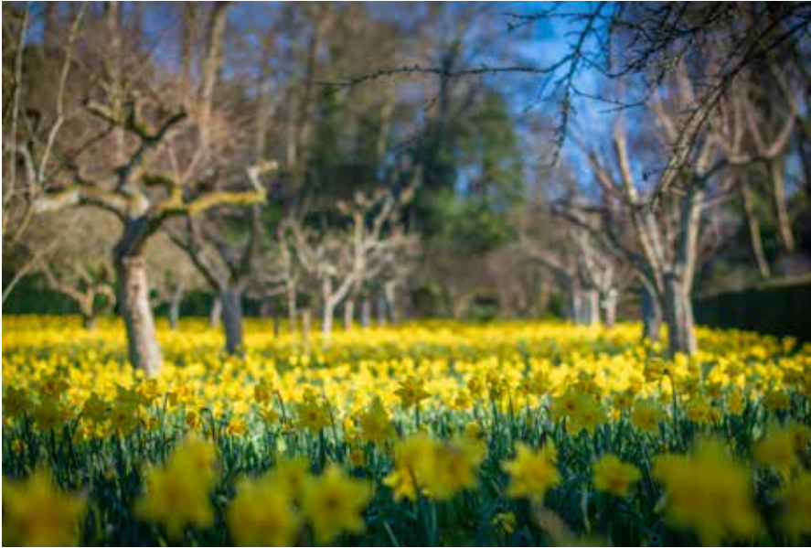
Daffodils in the Orchard at the Rococo Garden

During March, visiting hours are Wednesday to Sunday 10 til 5 with last admission at 4pm. Once the school holidays start we will be open Monday & Tuesday too, i.e. 25th & 26th March for our family Easter trail. No advance booking is needed this month although on peak days (eg Mothering Sunday, 10 March) the facility is always there to guarantee admission. This month I relish the daffodil display. We now have many tens of thousands now which bloom at different times as the spring sunshine warms up. The swathes of yellow are such a cheering sight after the gloom of winter and after planting more bulbs last autumn, the sight will be even more spectacular.