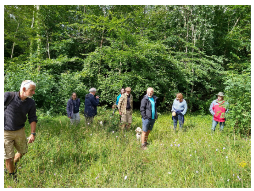
Painswick Beacon Conservation Group guided walk on the Beacon

CENTRELINE STONEMASONRY HISTORIC BUILDING REPAIRS & ALTERATIONS OI452 813892 OR 07967 316038 WWW.CENTRELINESTONE.CO.UK Faifax House, Vicarage Street, Painswick, Gl6 6XS