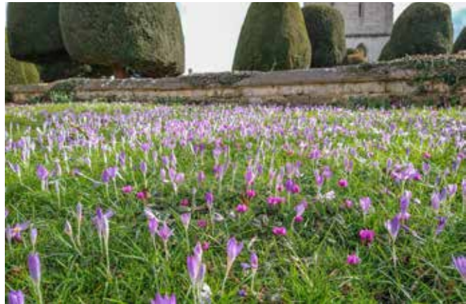
Above picture from the Rococo gardens