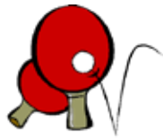
Table Tennis starts again on Thursday 15th September 6.15 to 8pm in the Beacon Hall at the Painswick Centre. Price still only £5 when you play.

The club supplies tables, nets, bats and balls. You supply sports or soft shoes, a sense of humour and a willingness to have some fun. Please do come and join us in this hand/eye co-ordination exercise and get fit at the same time.